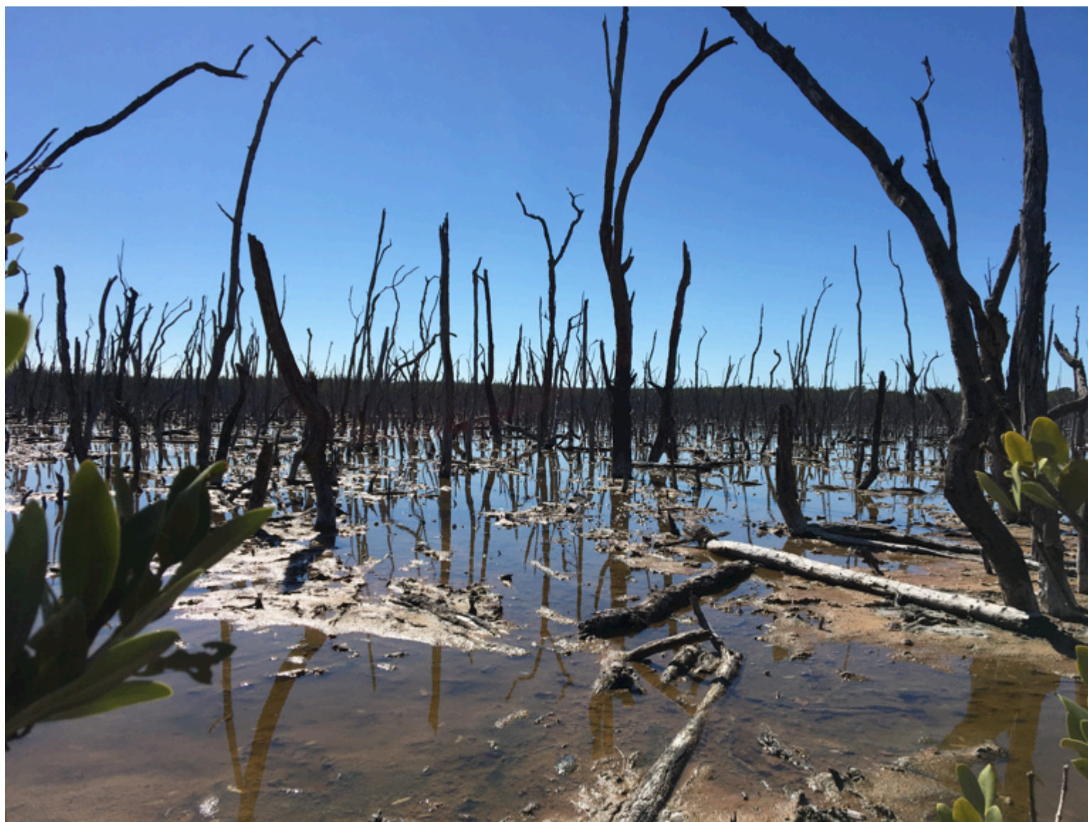
2017 Project: Assessing feasibility of mangrove restoration in southwest Florida Partner: Restore America's Estuaries, Rookery Bay National Estuarine Research Reserve