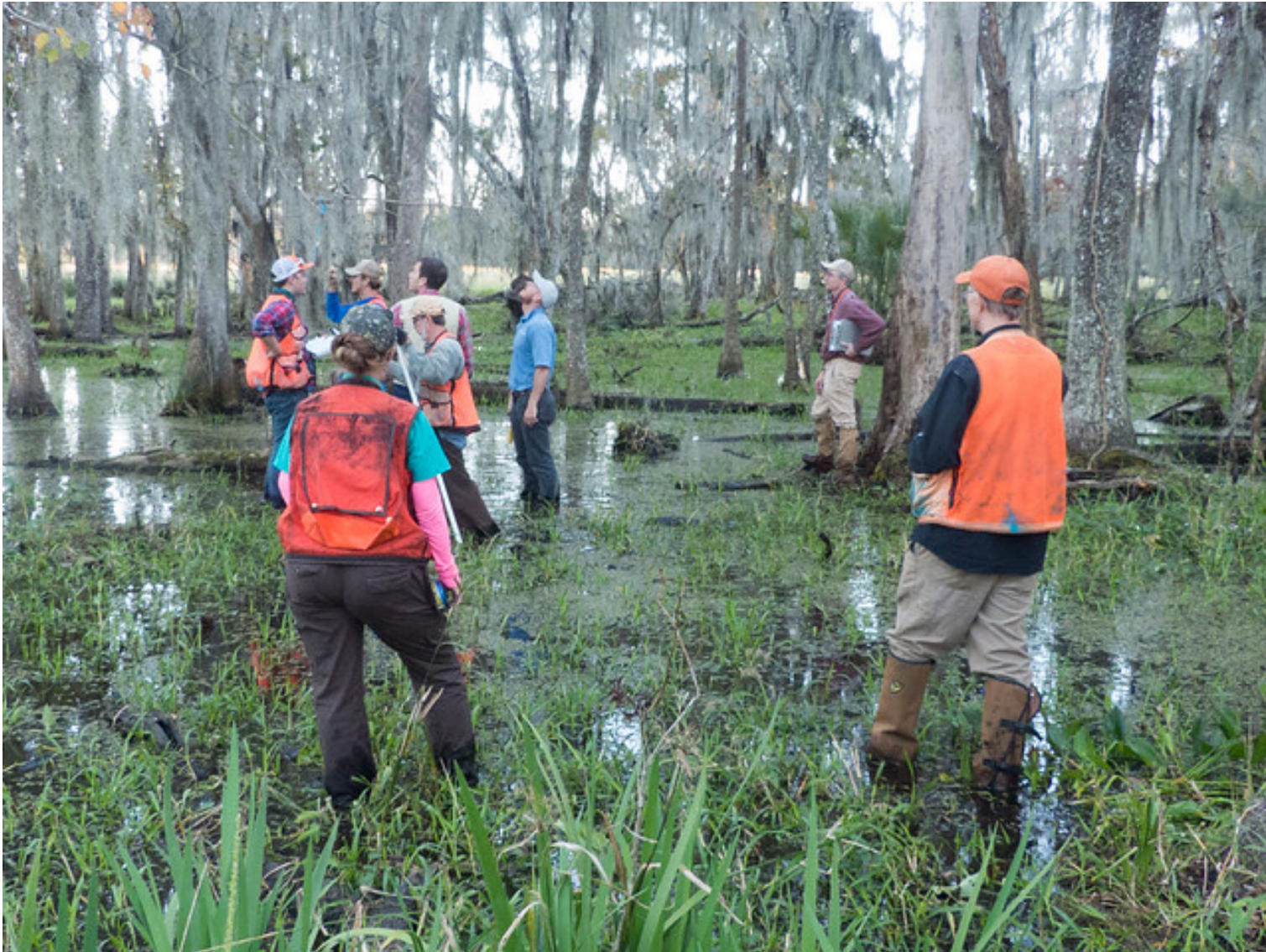
2018 Project: Forest carbon inventory training for Lower Green Swamp IFM Project in Florida Partners: The Climate Trust